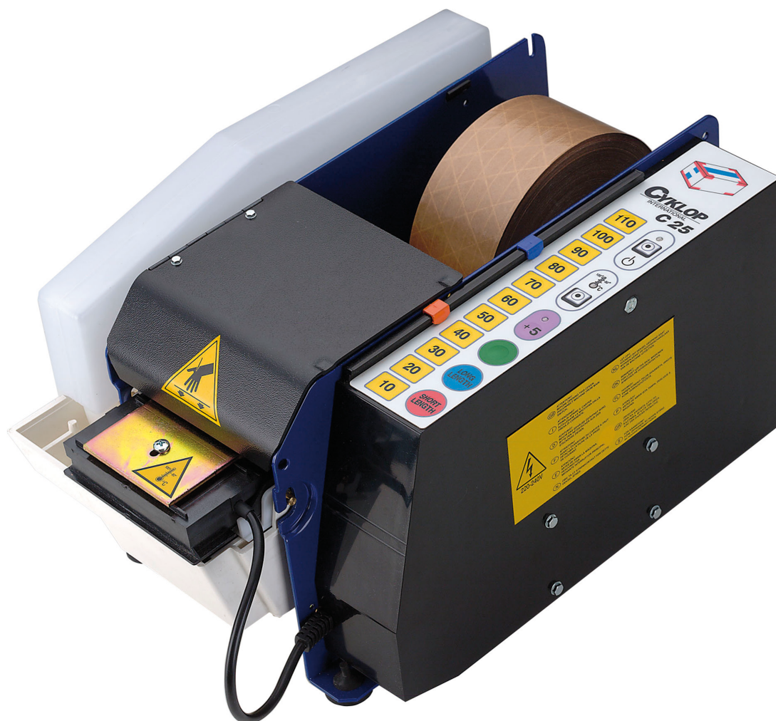
GUMMED PAPER DISPENSER MODEL ELECTRONIC: C 25