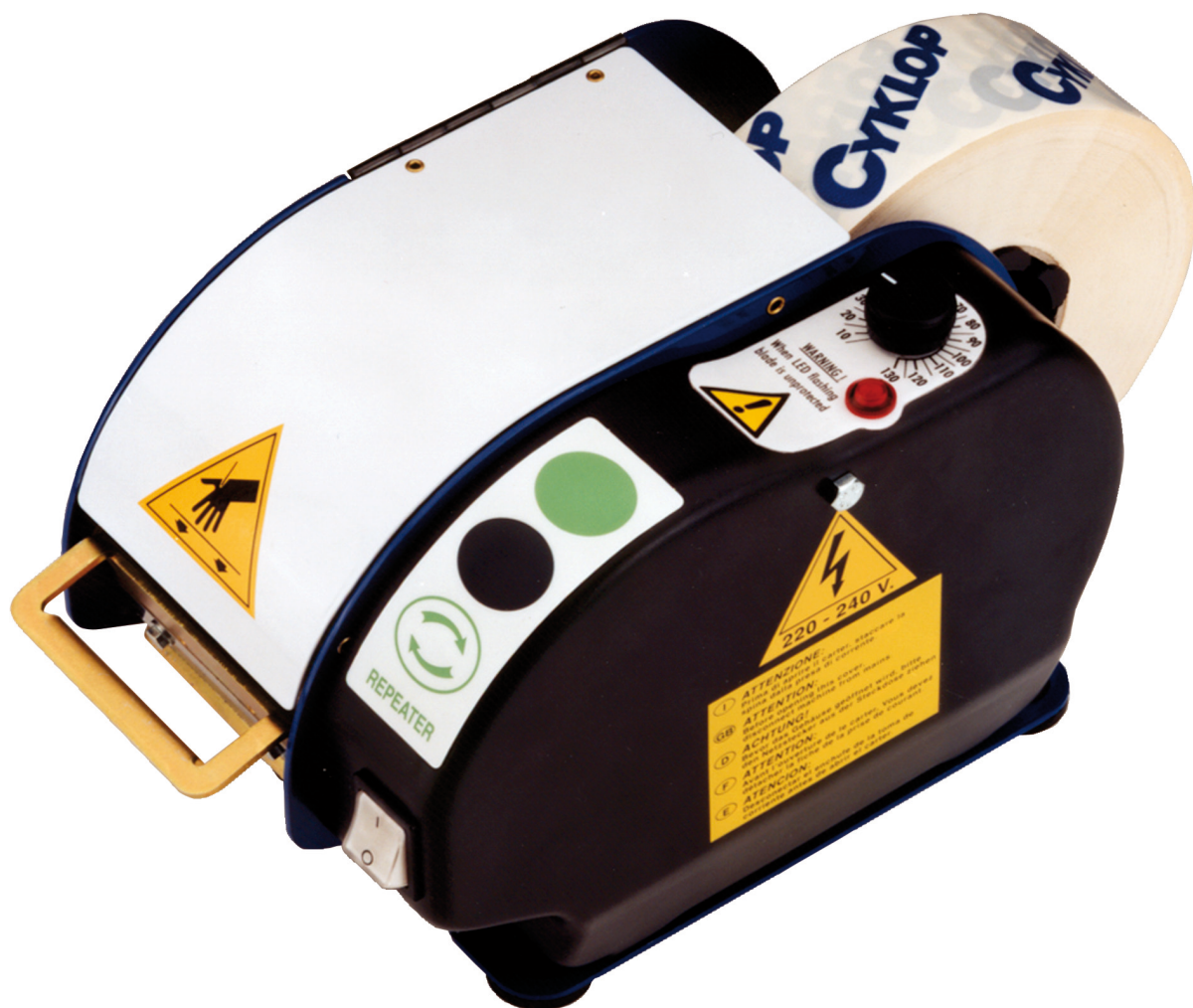
ELECTRONIC TAPE DISPENSER MODEL: BABY UMET-75